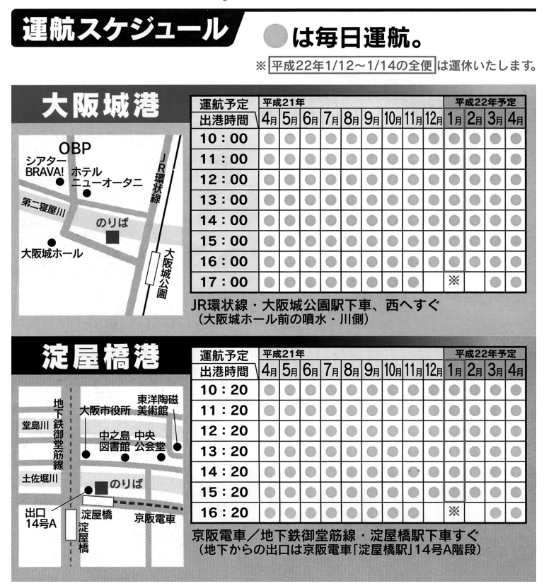
Table C Aqua Liner Timetable in Osaka